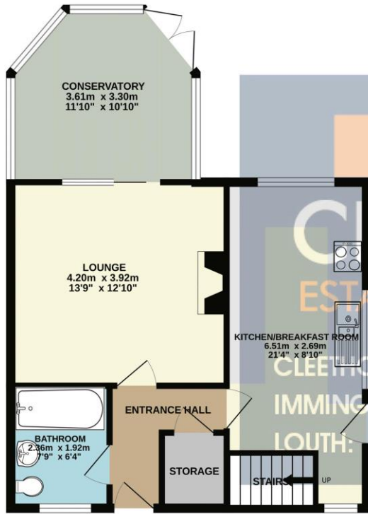
GROUND FLOOR 53.6 sq.m. (577 sq.ft.) approx.